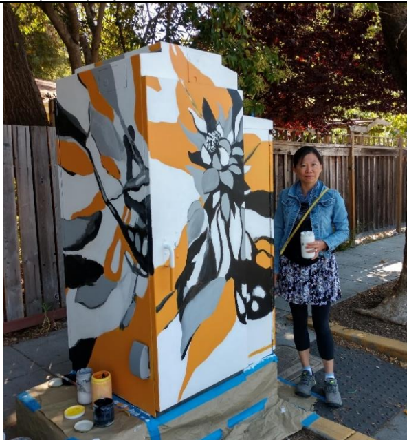
Utility box project in San Anselmo