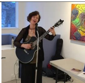
A song break during a watercolor workshop