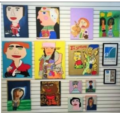
Alchemia Artists Exhibitory at Celebrating Community Arts event at MSA Art Center