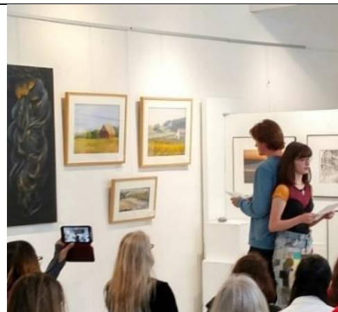
High school students slamming at the MSA Art Center