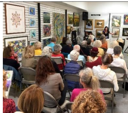
Poetry and music in motion at the MSA Art Center