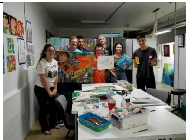
Alchemia artists in their workspace at MSA