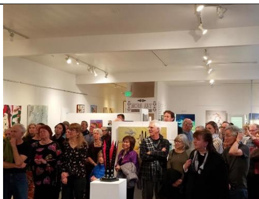
Listening to an art docent.