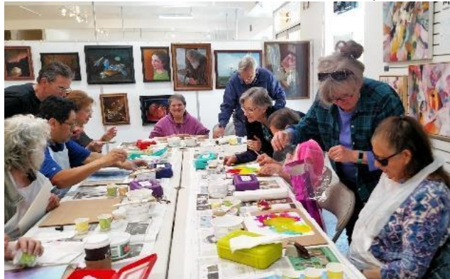
1-to1 volunteer aides with blind & vision impaired artists