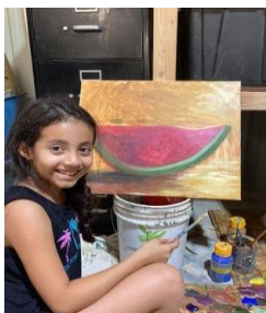
Budding talent with mouthwatering melon!