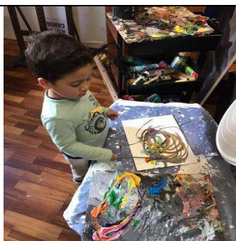
The whole world is a canvas!