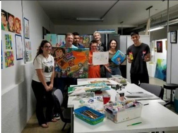
Alchemia artists in their workspace at MSA