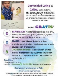
Spanish language invitation to join the CanalArts with Kids group.