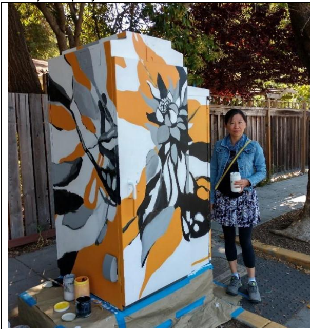
Utility box project in San Anselmo