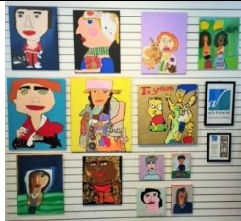
Alchemia Artists Exhibit at Celebrating Community Arts event at MSA Art Center