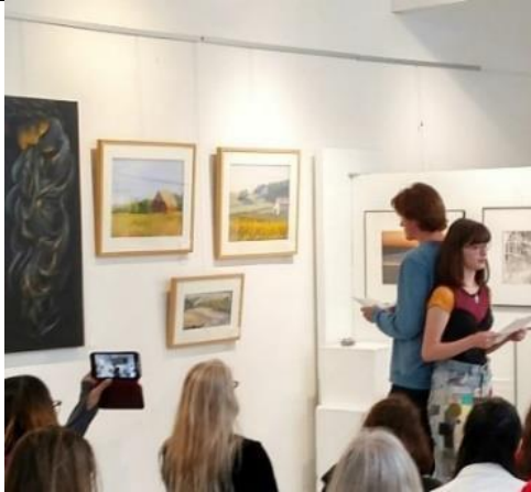
High school students slamming at the MSA Art Center