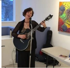
A song break during a watercolor workshop