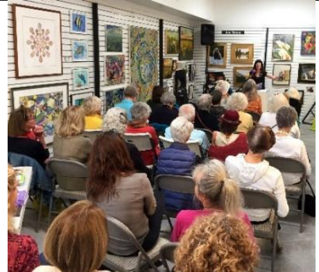
Poetry and music in motion at the MSA Art Center