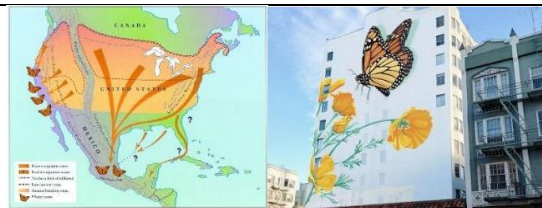
A teaching/learning moment on CanalArts with Kids: Learning of Monarch butterfly winter migration from the US to Mexico. Butterflies know no borders!